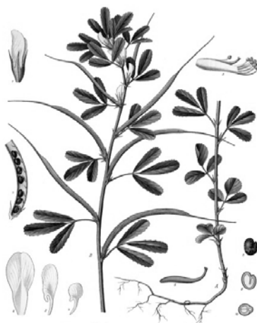
Fig. 2- Fenugreek ( Trigonella foenum-graecum L.)

provide a reliable basis to predict the performance of their progenies for a higher diosgenin content of seed, from very early generations [15, 18, 29].