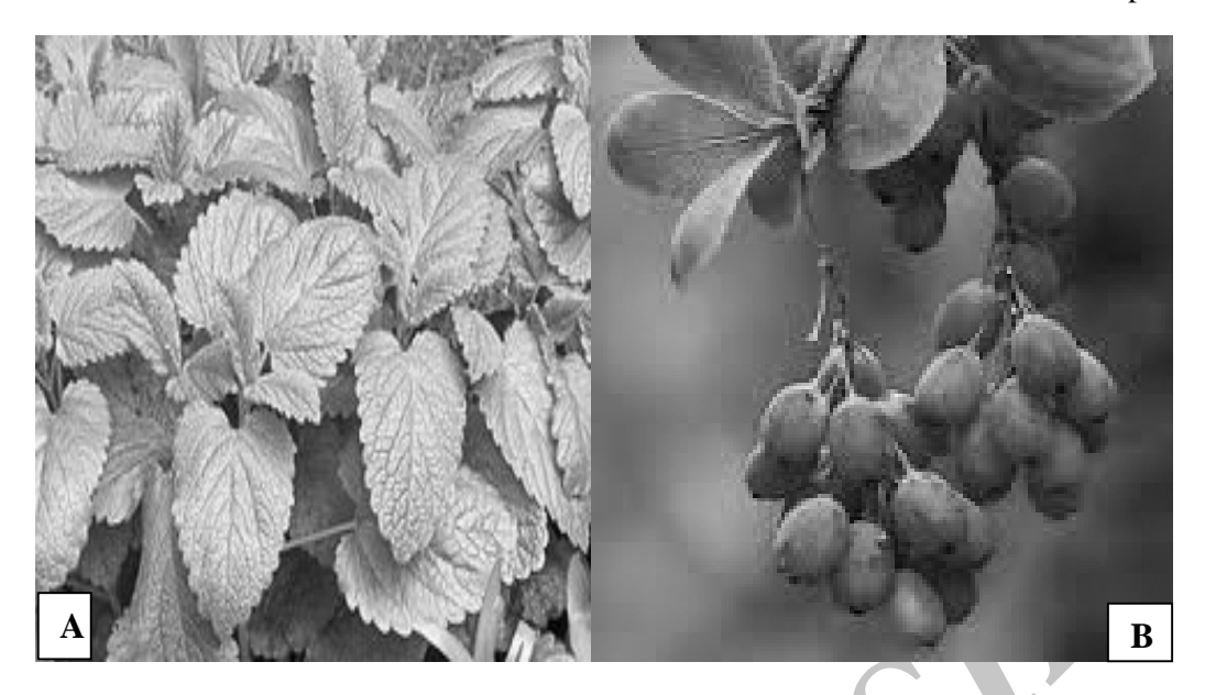
Figure 1- Melissa officinalis (A), Berberis vulgaris (B)