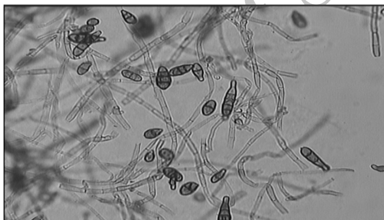
Figure 1- Alternaria alternata (ATCC6663) before exposure to Ajowan EO (40X)

thymol was found to be the major constituent of the Ajowan EO, although the thymol level was higher than previous studies. MIC level was measured in 71.4 percent of the samples 0.09 and in the remaining 28.6 percent 0.19 mg/ml. MFC level was measured in 57.1 percent of the samples 0.19 mg/ml, in 28.6 percent 0.78 mg/ml, and in 14.3 percent 0.39 mg/ml. These data are similar to previous studies. Serivastava et al. were demonstrated that Ajowan EO includes 11 component and thymol and \rho -cymene are main ingredients and also Ajowan has antifungal and antibacterial effects on gram positive and gram negative