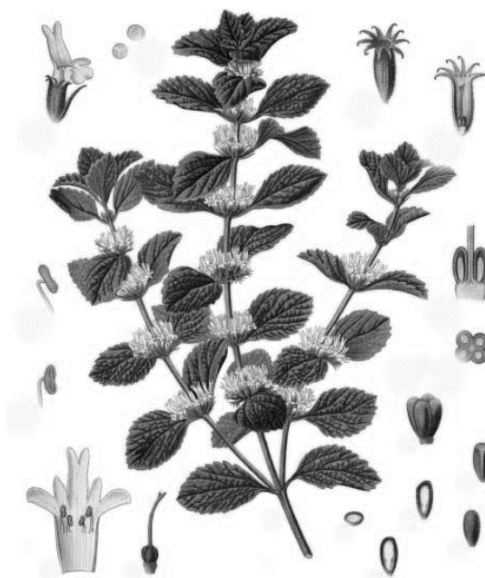
Figure 2- white horehound [ https://ast.wikipedia.org/wiki/Marrubium_vulgare ]