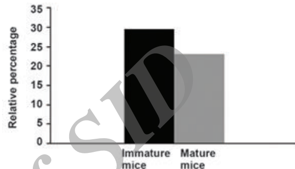
Fig.2: Relative percent changes of total experimental parameters compared to controls for mature and immature mice.

The experimental effect on all parameters showed that the relative percent change in all parameters in the test group compared to the control group in immature mice (29.52%) was approximately 1.2 times that of mature mice (12.23%). Figure 2 shows that the experimental changes in immature mice are more than seen in mature mice.