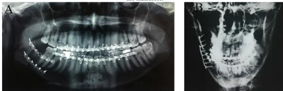
Figure 3- Radiographic images of the patient's mandible after open reduction and internal fixation. A- Panoramic view. B- Poster anterior (PA) view of the mandible

The patient underwent fixation surgical procedure and the broken pieces were fixed with two mini-plates, the superior one in monocortical manner to prevent the teeth roots damage and the inferior one was applied bicortically 11 (Figure 3). The patient was discharged from the hospital two days after surgery. Elastic guides were used at both sides to limit jaw movements during the six-week follow up period. After six weeks, the patient had normal occlusion and could open her mouth by 45 mm. The arch bar was then removed since the patient gained full recovery.