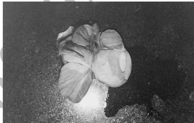
FIG. 1. Gross appearance of the tumor

*Corresponding author: Department of Pathology, Shaheed Labbafinejad Medical Center, Boustan 9, Pasdaran, Tehran, Iran. Postal code: 16666. Tel: +98 21 2549010-16, Fax: +98 21 2549039.