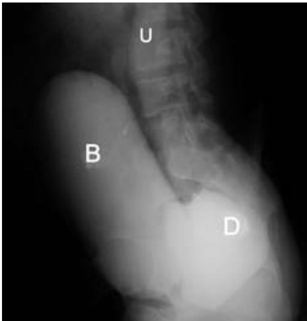
Figure 2. Lateral view of the bladder, the diverticulum, and the left ureter. B indicates the bladder; D, diverticulum; and U, the ureter.

prominent, our effort to find the right ureteral orifice was not successful. Posterior urethral valve (PUV) was not detected in our evaluation.