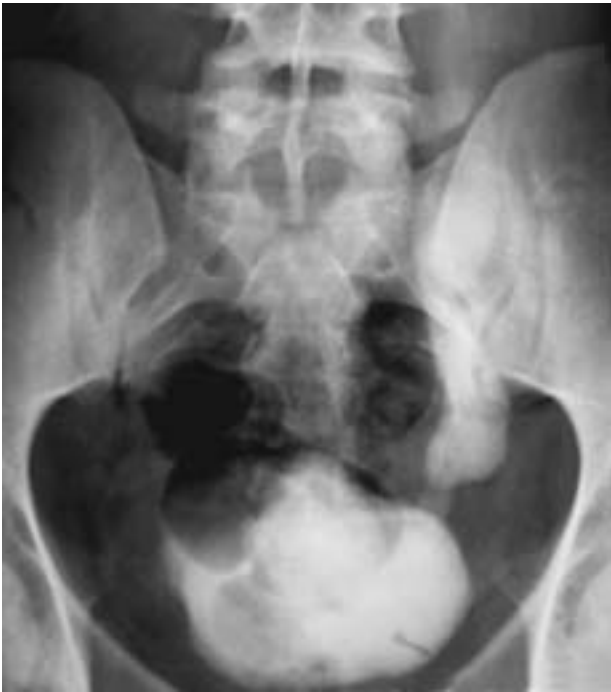
Figure 4. Postoperative voiding cystourethrography demonstrated no remained diverticula.

of a segment of the urethra or the attachment of a structure to the urethra by a narrow neck (ie, a Mullerian remnant). (4) This condition, especially in men, is extremely rare and may be congenital or acquired. An acquired diverticulum usually forms due to infection, urethral stricture, and/or trauma. (5) Majority of the cases with PUD are of the Mullerian origin. The remainders are formed as a result of an aborted urethral duplication. The Mullerian remnants may be prostatic utricles or Mullerian duct cysts. (1) Prostatic utricles do not usually require any treatment, unless they become very large causing recurrent UTIs or other complications. (4) Mullerian duct cysts are cystic dilatations in the remnants of the distal ends of the fused Mullerian ducts. They rarely communicate with the urethra. If they are connected to the urethra, they usually enter the midline of verumontanum. (1)