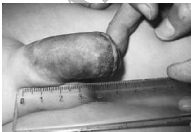
Figure 1. Penile shaft enlargement.

Received January 2006 Accepted December 2006