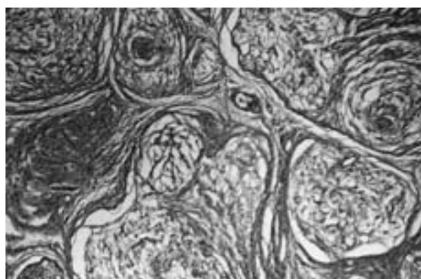
Figure 4. Histopathologic study revealed bundles of the spindle cells separated by fibrous septa in a mixoid matrix (hematoxylin-eosin, × 40).

At the 13th postoperative month, there was no significant increase in the size of the residual tumor on physical examination.