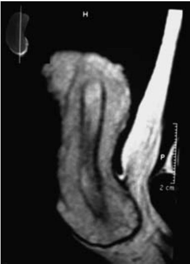
Figure 3. Penile mass (T2 weighted imaging).

Cystoscopy was indicative of a nonobstructive urethra.