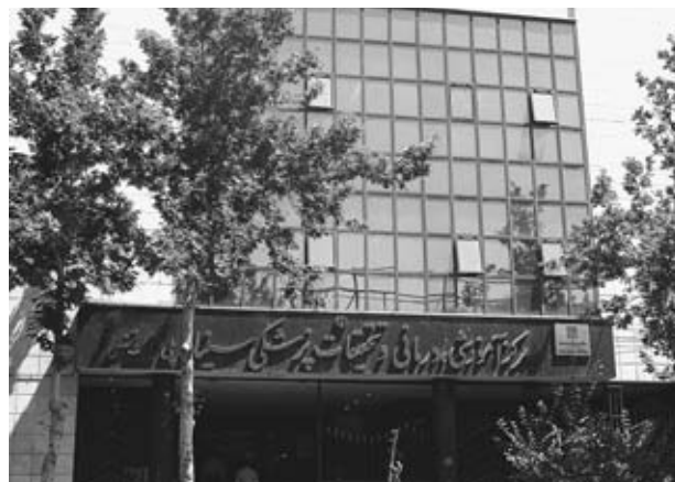
Figure 1. Left, Sina Hospital at its early years of activity. Right, Sina Hospital in 2007.