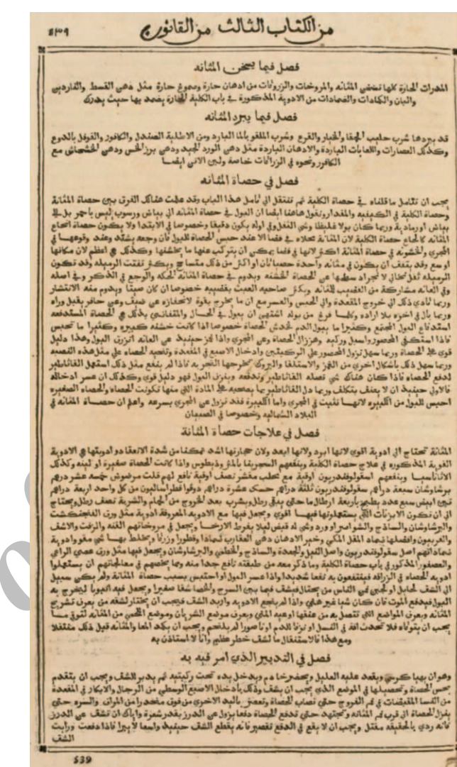
Figure 2. The third book (Part 19, Treatise 1, Chapter 6) of the Canon of Medicine in Arabic on surgical treatment of bladder calculi.

If urinary retention occurs in the presence of bladder calculus and it is not possible to incise