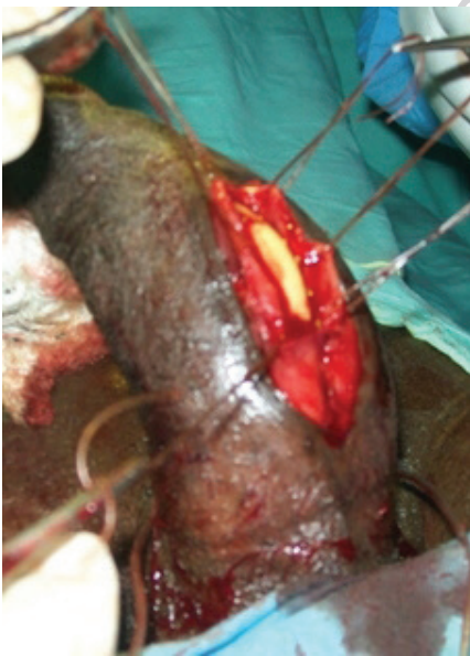
Figure 1. Urethrotomy incision exposing lumen of strictured segment with catheter in-situ.

One hundred and nine cases of urethral stricture diseases were managed in the three centers during the period of study out of which 34 patients (31.2%) had stricture located in the pendulous urethra. The ages of those with pendulous urethral disease ranged between 28 to 89 years with mean age of 53.6 years. None of the patients had insurance coverage for their treatment cost; all of the patients were self-sponsored with only 3 (< 1%) having hope of partial or full reimbursement from their employer. Etiology of the disease is as shown in Table with iatrogenic contributing the largest percentage. Thirteen of these (39.1%), resulted from urethral catheterization in the cause of treatment of medical and surgical conditions not related to the urinary system like cerebrovascular accident, severe head injury, meningitis and food poisoning. Others were due to post-operative complication of cystoscopy and prostatectomy for benign prostatic hyperplasia. Although 7 patients (20.6%) were initially diagnosed by urethrocystoscopy, the main diagnostic investigation was retrograde urethrography (Figure 6) which was done for all the patients. Nine patients (26.5%) had antegrade urethrogram in combination with