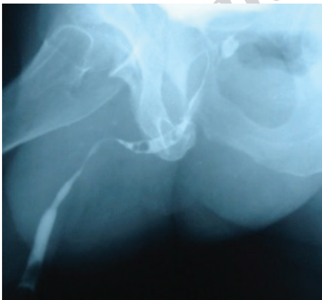
Figure 1. Pre-operative retrograde urethrogram of one of the patients.

We found urethrography adequate to confirm the diagnosis and plan repair for these patients. Information obtained on retrograde urethrogram may be limited where there is complete obstruction or when the stricture extends to involve the fossa navicularis due to obscuring of area of interest by injection device. (7) In such situation we used micturating urethrography in isolation or in combination with retrograde urethrography to evaluate the stricture.