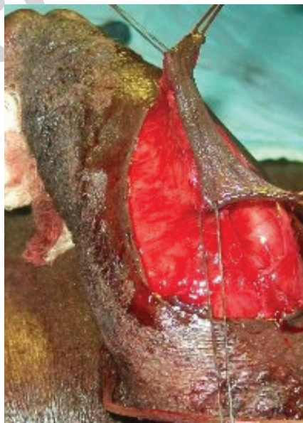
Figure 2. Longitudinal distal penile island flap on a vascularized pedicle.