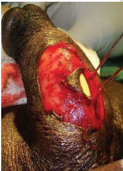
Figure 4. Ongoing anastomosis of flap to the other side of native urethra.

Pendulous urethral stricture is not as common as strictures in other segments of the urethra. It constitutes 29.1% of all cases of urethral stricture disease seen in our centers over