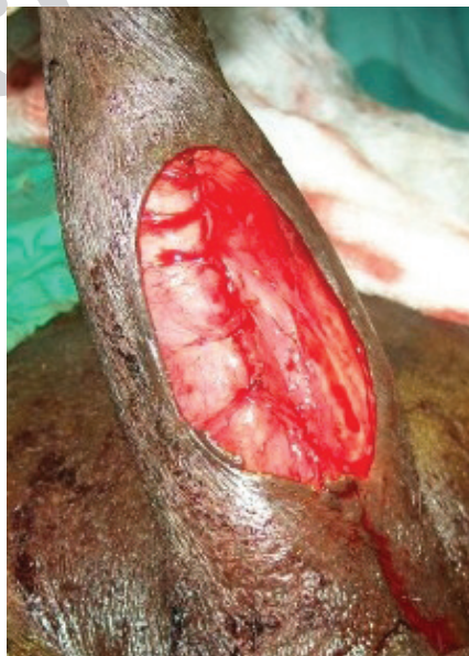
Figure 5. Reinforcement of repair with layer of dartos fascia before skin closure.