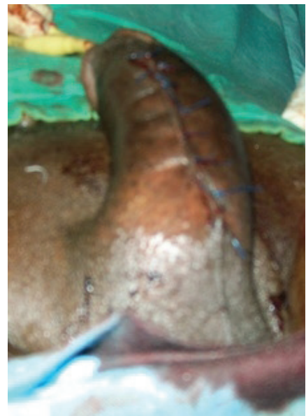
Figure 6. Penile appearance immediately after skin closure.