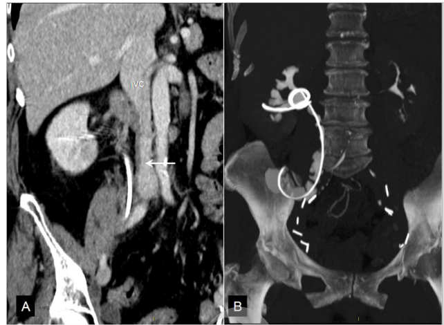
Figure 2. Computed tomography-urography performed prior to the ureteral stent removal, note the complete healing of the inferior vena cava wall.

microembolism. Therefore, nephrostomy and antegrade ureteral stent were positioned in addition to the anticoagulant/antimicrobial therapy. After one month, the CTU performed prior to the ureteral stent removal demonstrated the complete healing of the IVC wall (Figure 2A, arrow) and the absence of the passage of iodinated urine in the lumen of the vein (Figure 2B). The antegrade pyelography, carried out without ureteral stent, confirmed the complete resolution of the fistula with regular flow of the iodinated urine in the IC (Figure 3).