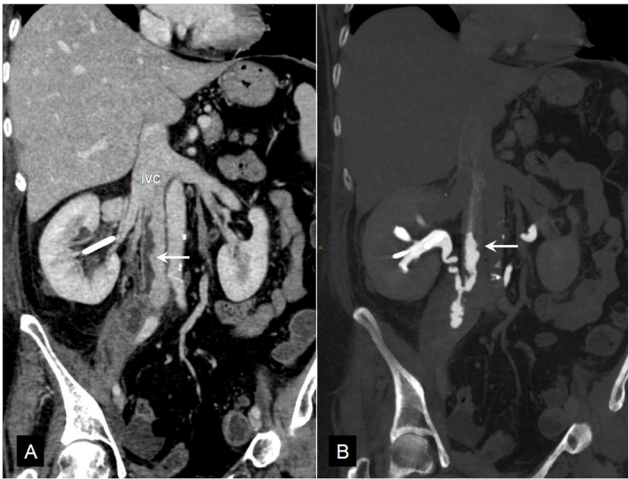
Figure 1. Inferior vena cava with thrombus in the lumen at the level of right ureteral anastomosis, arrow highlights the urinary fistula between the ureter and inferior vena cava.

passage of iodinated urine in the lumen of the IVC through the fistula). The examination excluded abdominal fluid collections; pulmonary microembolism was also present. Due to the high surgical risk, we decided to perform a conservative treatment to allow the complete exclusion of the urinary system and the treatment of IVC thrombosis and pulmonary