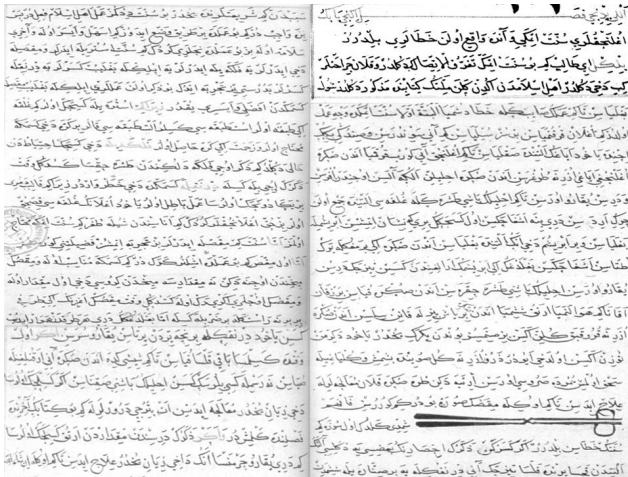
Figure 1. Original circumcision chapter in Uzel's book.

can understand what do they like (Figure 1).