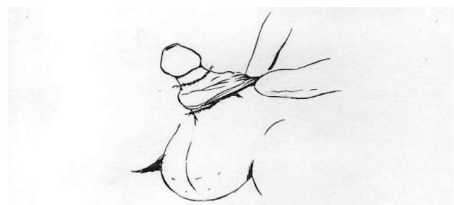
Figure 4. "Tie another silk rope below the first silk rope, then hold the prepuce with your two finger and pull down."

Also preputial plasty is suggested as an alternative surgery for circumcision. (6) Also, there are many surgical methods. Sleeve resection is the most similar method with Sabuncuoglu's circumcision. In sleeve resection, prepuce is not squeezed as in