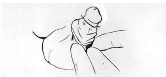
Figure 3. "... mark the cutting line with silk rope and fasten."

Surgical excision of the foreskin on the glans is simply named as circumcision. (5) It is one of the oldest procedures. (6) Investigations on Egyptian mummies revealed circumcision evidences. (6) Pre-Islamic and early Islamic documentations also