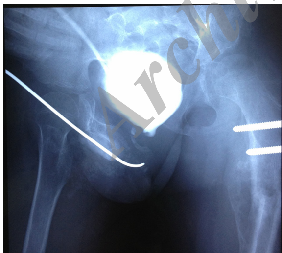
Figure 1. Preoperative combined cystography and retrograde urethrography.

A 9 year-old boy with a long PFUDD was admitted to our hospital in April 2013. Five months before the admission, the boy suffered pelvic fracture and posterior urethral disruption caused by a traffic accident. Given the severity of the combined injuries, he underwent suprapubic cystostomy for acute phase management. Five months later, we performed urethrogram and cystoscopy and found that the urethral distraction defect was 6 cm in length ( Figure 1 ). Perineal urethroplasty was thereby performed. In the operation, the boy was placed in the lithotomy position. The bulbospongiosus muscle was dissected through an inverted Y-shaped incision. Afterwards, the bulbar urethra was circumferentially dissected down to its proximal end and sharply divided at the strictured segment. To increase the perineal space, the midline intercrural incision was made and the lower part of pubic symphysis was removed with a power drill. The scar tissue involving the membranoprostic region was excised using retrograde piecemeal method until healthy, soft and pliable mucosa of proximal urethra was identified. This step was assisted by antegrade passage of a bougie through the suprapubic tract. In the last procedure, we placed a 10 French Foley catheter through the urethra into the bladder and performed the end-to-end anastomosis. The operation lasted for five