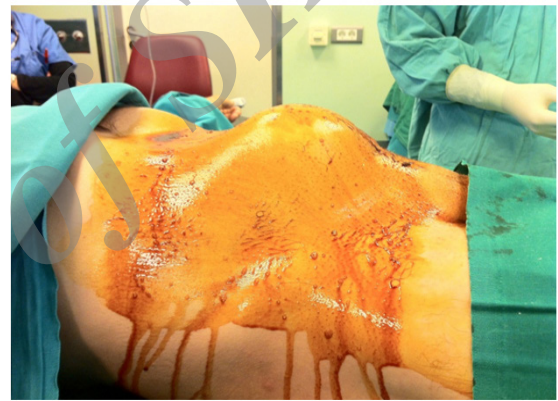
Figure 2. Suprapubic protrusion produced by bladder stone.