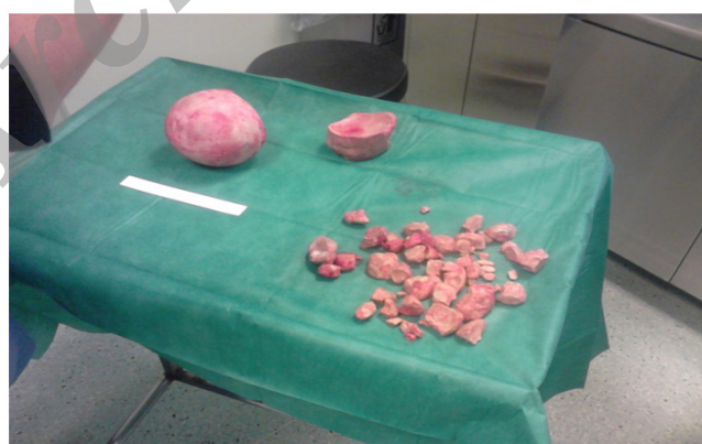
Figure 3. Stone burden after removal.

Department of Urology, Athens General Hospital "G. Gennimatas", Athens, Greece.