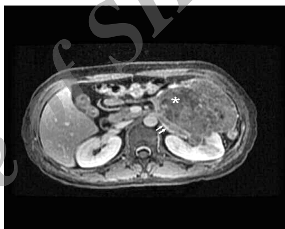
Figure 2. T1-weighted (450/10) postcontrast image showing a moderately enhancing solid mass in the left kidney interpolar area. The mass contained a non-enhancing hypointense area in its central portion suggestive of hemorrhage or necrosis (asterisk), and a non-enhancing filling defect was observed in the left renal vein suggestive of renal vein thrombosis (arrowheads).

A) Precontrast axial computed tomography image showing an 11 cm sized isoattenuating solid mass in the left kidney interpolar area. Note the subtle low-attenuated lesion (asterisk) in the central portion of the mass suggesting hemorrhage or necrosis; B) Contrast-enhanced axial computed tomography image showing a moderately enhancing solid mass in the left kidney interpolar area. The mass involved renal pelvis (arrowheads) and contained a hypoattenuating area suggesting hemorrhage or necrosis (asterisk). The image also depicted a hypoattenuated lesion in the left renal vein suggestive of renal vein thrombosis; C) Unenhanced axial T2-weighted (4000/110) image shows an isointense mass (relative to liver) in the interpolar area of the left kidney. Foci of hyperintensity (arrowheads) were also observed in the central portion on T2-weighted images possibly representing necrosis or hemorrhage; D) Out of phase coronal T1-weighted (450/10) precontrast image showing an isointense solid mass (relative to liver) in the left kidney. Focal hyperintense lesions without signal drop (arrowheads), possibly due to hemorrhage, were also noted.