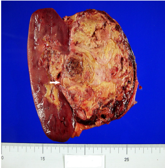
Figure 3. Photograph shows the solid renal mass with yellowish necrosis and reddish hemorrhage. Note the mass invaded the renal sinus (arrow).