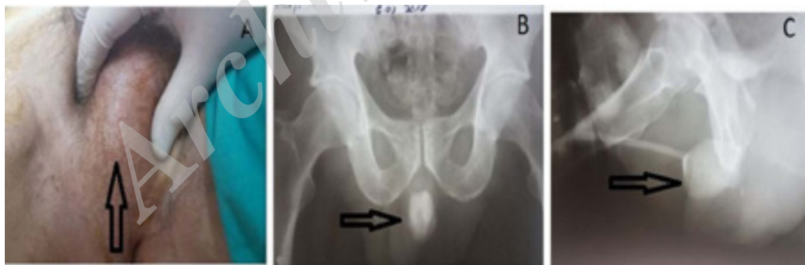
Figure 1. A. Hard and round palpable mass in the perineum. B. Voluminous and round radiopaque image in perineum. C. Voluminous and round radiopaque image in perineum, with urethral involvement.

Urinary incontinence after spinal cord injury is a major problem affecting the quality of life of those patients. Patients not responding to drug treatment can benefit from a surgical treatment with inconsistent results (1) . Suburethral sling, especially from synthetic materials, is most commonly used in patients with stress urinary incontinence as a complication of radical prostatectomy. As a technical option, this procedure can also be used in patients with urinary incontinence after congenital or acquired neurological lesions, being considered second-line therapy after failure of non-surgical methods (1,2) . Although the overall rate of success is appreciated between 50 and 85%, with very low frequency of complications, these interventions can sometimes be followed by redundant complications (2,3) .