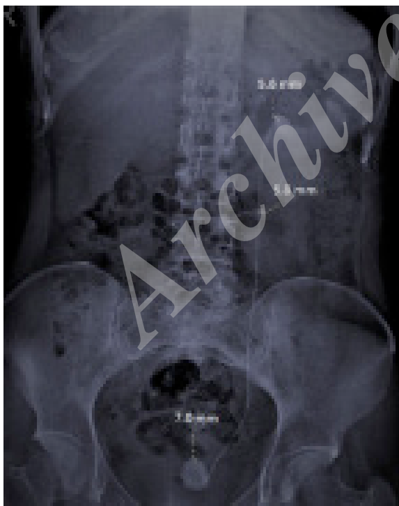
Figure 1. A 30-year old female patient presenting with a urinary tract infection had a ureteral stent present for 33 months. The KUB score was 13 (K=5, U=3, B=5) and the stone surface area was calculated as 360 mm 2 in the kidney, 90 mm 2 in the ureter, 624 mm 2 in the bladder. The patient underwent transurethral cystolithotripsy, semi-rigid URS, and flexible URS in a multi-modal fashion in a single session, and stent-free and stone-free status was achieved.

of the first month after treatment, creatinine levels were measured, both KUB and ultrasound were performed in each patient, and additional investigations were made as necessary. In cases with prolonged ureteral stent, the presence of encrustation was assessed with KUB \pm non-contrast computed tomography (NCCT). NCCT was performed as an ancillary imaging when ureteral stent could not be removed using simple cystoscopy and if encrustation was suspected. Encrustations were categorized according to localization as kidney, ureter, and bladder areas. Stone surface areas were calculated with KUB using the formula: length x width. After calculat-