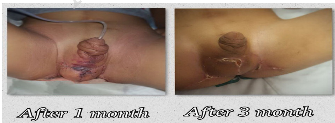
Figure 3. Follow up after twenty days and also after three months

Overall the resultant appearance is acceptable and the parents were satisfied with the outcomes of the surgery. This new technique of scrotoplasty with raised perineal flaps and de-epithelialized border is a good option in cases of scrotal destruction and agenesis and does not require an uncircumcised condition.