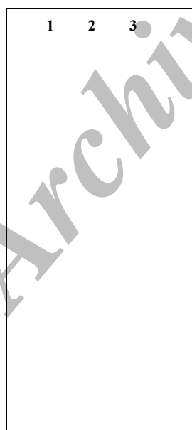
Figure 4. Western blotting analysis of expressed human IFN- \gamma in pET3a and pRSETA. Lane 1 is the expressed IFN- \gamma protein in pETa with synthetic gene. Lane 2 is expressed IFN- \gamma protein in pRSETA with natural Iranian gene