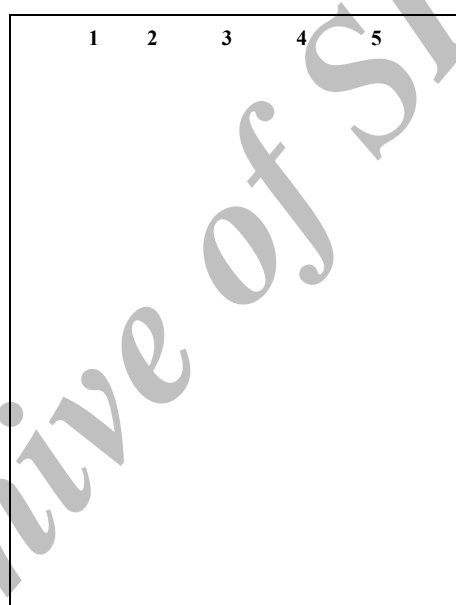
Figure 5. SDS-PAGE analysis of expression of pET32a-IFN plasmid in E. coli . Lane1: Low molecular weight standard proteins, lane2: human IFN- \gamma monomer and dimer, lane3: pET32a-IFN before induction, lanes 4, 5: pET32a-IFN after induction

The expression of hIFN- \gamma has been determined by the northern blotting because the IFN- \gamma protein has not been detected by SDS-PAGE and western blotting of pET32a-IFN, pQE30-IFN and pASK-IBA-IFN plasmids (Figure 5). Data of pQE30-IFN and pASK-IBA-IFN plasmids are not shown. However, the expression of IFN- \gamma protein has not been detected by SDS-PAGE and western blotting, the results of northern blotting showed that the gene of hIFN- \gamma was transcribed in cells with pET32a-IFN, pQE30-IFN and pASK-IBA-IFN plasmids.