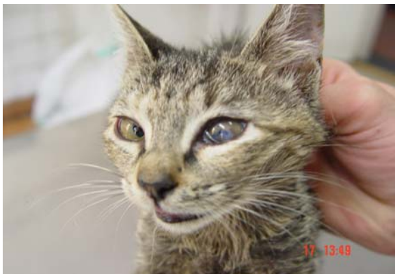
Figure 3. Unilateral anterior uveitis in infected kitten with Toxoplasma gondii .

oocysts till day 30 after infection. In group 3, two of 7 kittens (28/6 %) shed oocyst on day 11 to 18 after infection. In this group number and duration of oocyst shedding, were lower compared with group 1. In group 4, Monensin 0.02% in food prevented oocyst shedding in all of seven kittens (100%). Based on Fishers statistic test, oocyst shedding in group 1 compared with other groups was significant ( p = 0.0005 ), but obtained results did not show any significant difference between kittens in groups 2, 3 and 4 ( p > 0.05 ), Although 2 kittens of group 3 shed oocyst. Hematological values in 28 kittens were normal before examination but final results showed Leucocytosis, Neutrophilia, Lymphocytosis and Eosinophilia in 4, 3, 2 and 3 kittens of group 1 respectively.