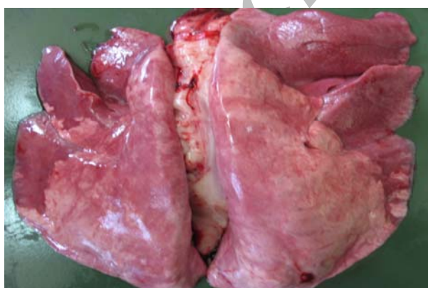
Figure 3. Showing raised lesions and consolidation in lung tissue at the right cranio-ventral lobes.

In accordance to our studies the combination of isolating Pasteurella multocida and Mycoplasma spp. from the lung tissue in oneinfected sheep with progressive pneumonia and P. caballi and P. dagmatis in one infected goat with pleuropneumonia are also recorded. Daniel in 2006 reported that high prevalence of pneumonia in spring born lambs in comparison with the other seasons which was complied with our studies.