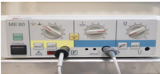
Figure 1. Electrosurgery unit (Bovie machine)

Electrosurgery Unit and Animal Preparation. The electrosurgery unit (Bovie machine; Figure 1) used in this study was KLS Martin ME 80 (KLS Martin Group, Germany). This unit has three main parts, including 1) monopolar electrodes (Surgi-pen; Figure 2) attached to a needle electrode with 0.4 mm outer diameter to make an incision in the skin, 2) rubber neutral electrode for children (8×16 cm; Figure 3) with a single contact surface of 120 cm 2 , and 3) monopolar double-pedal footswitch (Figure 4). Several serious precautions should be followed while performing electrosurgery as a preferred surgical method. To avoid animal burning it is necessary to ensure that the animal back skin is fully connected to the rubber neutral electrode; therefore, before putting the mouse on the rubber neutral electrode, it is required to cover the back skin with a water-based lubricant.