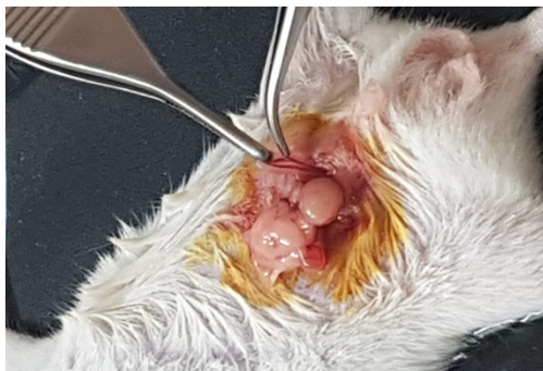
Figure 5. Vas deferens

Electrosurgery. The surgi-pen was plugged into the Bovie machine. Before setting up the electrical flow rate and frequency, the needle electrode was connected to the surgi-pen. Then the device was turned on, and the yellow pedal was pushed on the footswitch. In this step, a close contact is made between the needle electrode and shaved skin in the medial line of the abdomen (for detailed procedure see the supplementary video 2 ). A 10 mm longitudinal skin incision was performed about 1 cm above the penis. After making 1 cm incision in the abdomen skin and body wall, the testicular adipose pad of one side was grabbed with micro-dissecting serrated forceps and pulled to expose testis, then the vas deferens was cut (Figure 5).