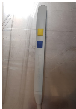
Figure 2. Monopolar electrodes (surgi-pen) equipped with cut and coagulation switch