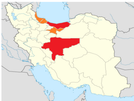
Figure 1. Location of sampled provinces in Iran (These provinces are the leaders of the growing turkey industry in Iran.)

Ornithobacterium rhinotracheale , and B. avium as the causative agents of airsacculitis. In the current study, B. avium isolates were partially sensitive to ampicillin as opposed to the isolates studied in the US (Beach et al., 2012). Hence, it is required to investigate airsacculitis cases in broiler chicken flocks and role of B. avium in future studies. The phylogenetic tree constructed based on 29 sequences of the piuA obtained from GenBank showed that the isolates from Iran grouped together tightly. Most of the 22 comparison sequences were isolated in the US. The implications of this result cannot be appreciated until the full genome sequencing of the isolates is completed. To the best of our knowledge, the current study is the first attempt toward identifying B. avium in sick turkeys in Iran.