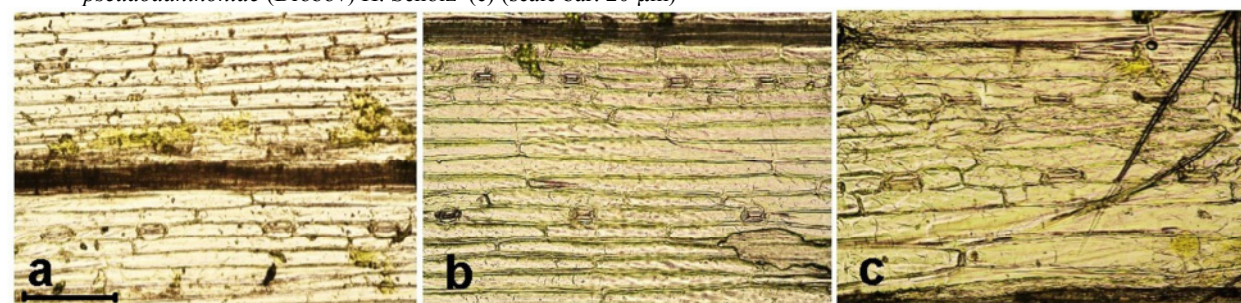
Fig. 3. Upper leaf surface structure of Bromus danthoniae subsp. danthoniae (a), var. lanuginosus Roshev. (b) and subsp. pseudodanthoniae (Drobov) H. Scholz (c) (scale bar: 200 \mu m)