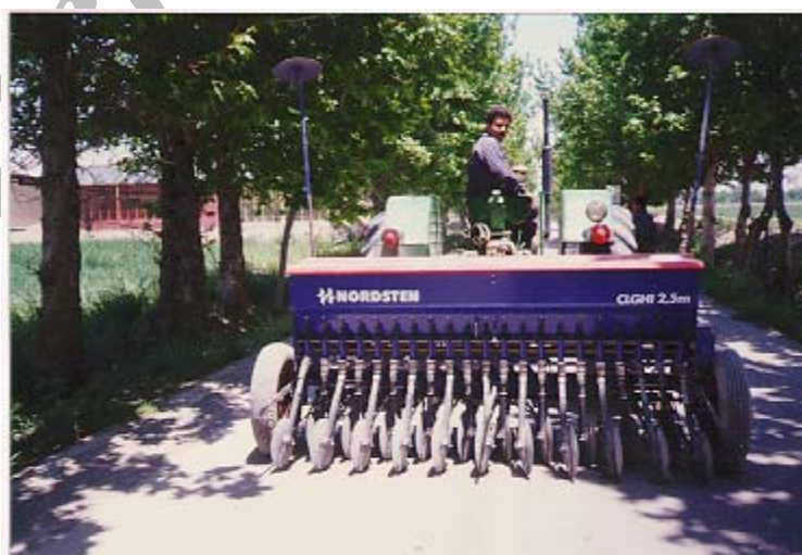
Figure 3. Nordsten grain drill with single disk openers.

per meter, P_n is the number of seeds planted per meter, and G is the germination percent (decimal). Once plant counts were completed, all seedlings that emerged within the two 1 metre long seed row sections in each plot were pulled out, and their chlorophyll-free length was measured as an indication of soil coverage (seeding depth). The plant height was measured in other two 1 metre long seed row sections of each plot 35 days after planting. The height measurement of