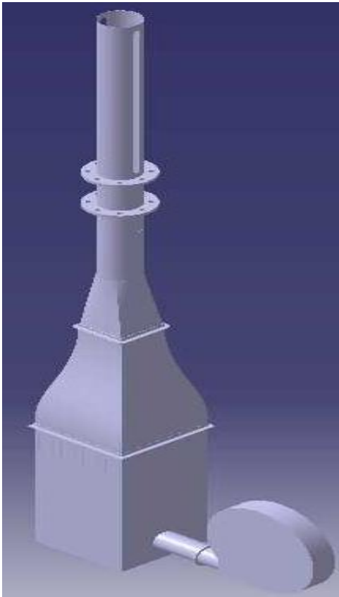
Figure 1. Schematic diagram of wind tunnel for terminal velocity measurement.

tions). The first part of flow straightener section consisted of a sufficient number of 10 cm long, 2 cm diameter tubes laid vertically above the fan so as to cover its entire cross-section. Two wire-mesh screens were laid above the co-axial mesh tubes. The second part of flow straightener section consisted of a sufficient number of 10 cm long, 0.6 cm diameter straws laid vertically below the pitot-tube and a wire-mesh screen was laid above the co-axial mesh straws. This setup provided a uniform velocity profile over the cross-section except near the wind tunnel wall. Figure 1 illustrates the wind tunnel and setup.