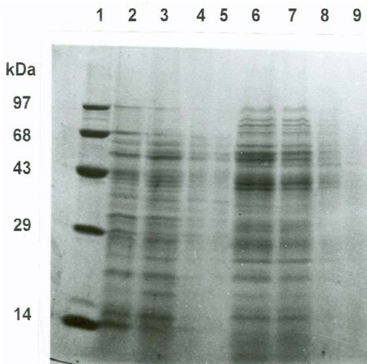
Figure 2. Extra cellular protein profile of bacterial strains.

Lane 1: Protein marker; 2: FP7 in King's medium B; 3: FP7 in King's medium B + 1% chitin; 4: FP7 in chitin alone; 5: FP7 in water alone; 6: PF1 in King's medium B; 7: PF1 in King's medium B + 1% chitin; 8: PF1 in chitin alone; 9: PF1 in water alone.