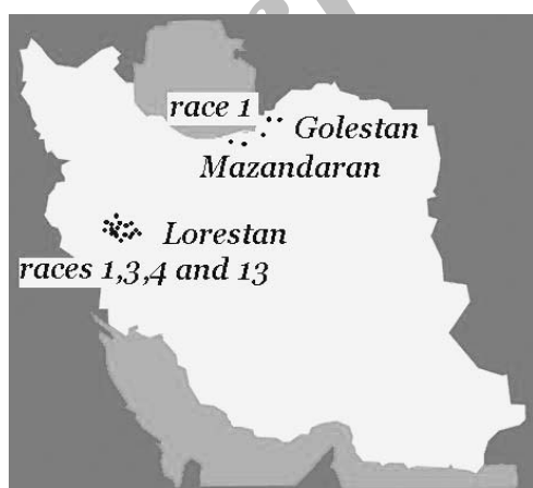
Figure 2. Distribution of the isolates and races in Lorestan, Mazandaran and Golestan Provinces.

About 22 isolates of P. sojae from 35 different farms country-wide were obtained during this research. The reactions of the isolates on the differential sets using the hypocotyls inoculation method are shown in