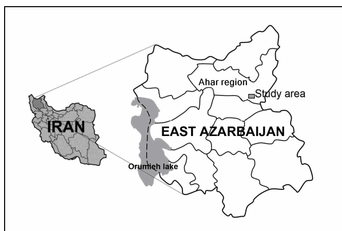
Figure1. Location of the study area (East Azarbaijan, IRAN).