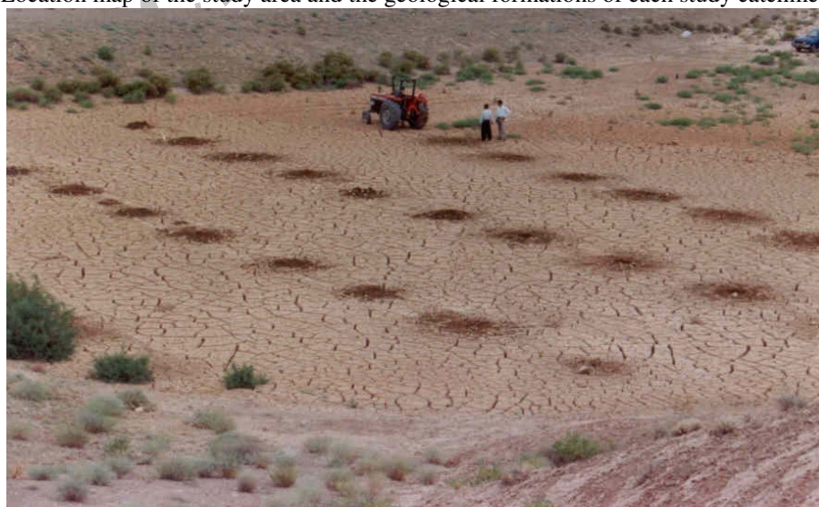
Figure 2. Some examples of the profile pits.