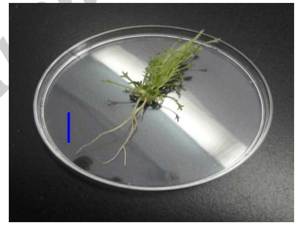
Figure 2: In vitro root formation of Achillea millefolium on MS + 0.3 mg/L NAA after 5 weeks. The bar represents 5 mm.