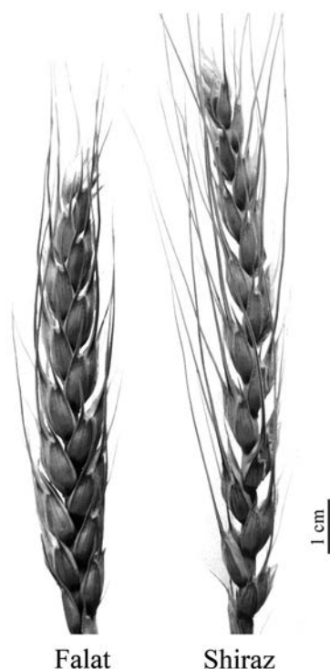
Figure 1. Spikes of Falat and Shiraz cultivars, which are different in spike compactness.

plot was 1 m 2 composed of four 0.5×0.5 m quadrates. Finally, the grain yield of each cultivar was determined by weighing the samples, and then total grain yield of the mixture was calculated by the summation of the two related values.