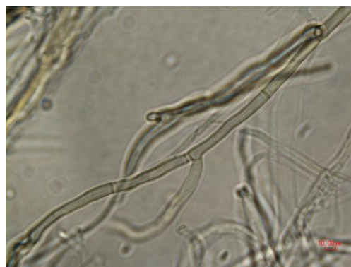
Figure 1. Middle simple hyphopodia of Ggt that have formed aggregation.

The selective medium for fungal culturing was Potato Dextrose Agar (PDA) containing streptomycin (0.03 gram in 1,000 cc PDA).