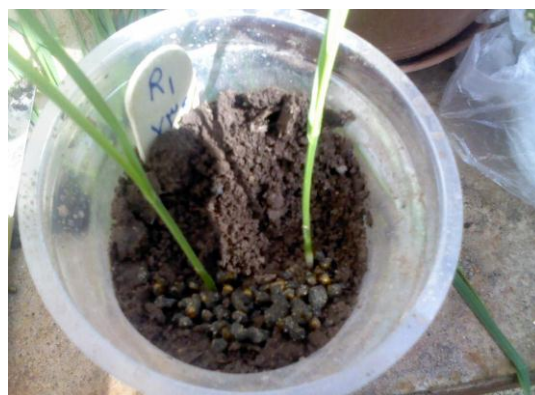
Figure 2. Inoculated on wheat seedlings.

ANOVA and logistic regression analyses were performed using MINITAB 14 statistical software. PLSD and mean comparison test was done by SAS statistical software.