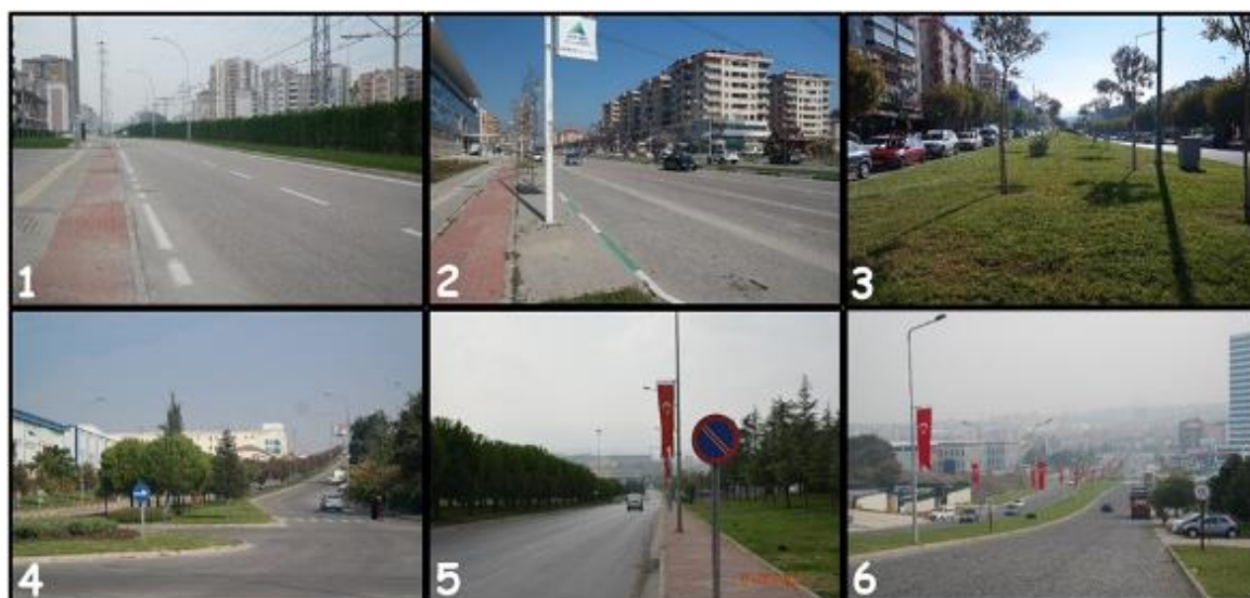
Figure 2. Bursa Nilüfer District Boulevards overview: (1) Uğur Mumcu Boulevard, (2) Ahmet Taner Kışlalı Boulevard, (3) Fatih Sultan Mehmet Boulevard, (4) Nilüfer Boulevard, (5) Atatürk Boulevard, and (6) 75. Yıl Boulevard.

Nilüfer Boulevard: The Nilüfer Boulevard located in the Nilüfer Industrial Zone intersects with Atatürk Boulevard. It is 1.10 km long.