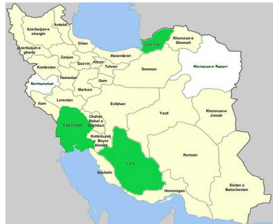
Figure 1. Map of Iran showing the research provinces.

Appropriate crop rotation is one of the primary principles of CA. Crop rotation and cropping pattern may be different based on climate conditions. Therefore, farmers collect information and knowledge to choose appropriate crop rotation from various sources. The results are shown in (Table 2 and Figure 2-a). It is seen that the pioneer farmers and CA project farmers have played the most important roles in knowledge and information dissemination about crop rotation among farmers. Based on the results, the pioneer farmers were the leader in selecting cropping pattern. The centrality, betweenness, and closeness degree of the pioneer farmers were the highest among all actors. The family members were the third main driver of crop rotation. The centrality, betweenness, and closeness degree of the family members were 23.48, 11.28, and 10.27, respectively. Also, the rural cooperatives had been referred to the least as a source of information by farmers. These results are consistent with the results of Solano et al. (2003), Hedjazi and Veisi (2007), Rehman et al. (2013), and Safi Cis et al. (2014). They stated that