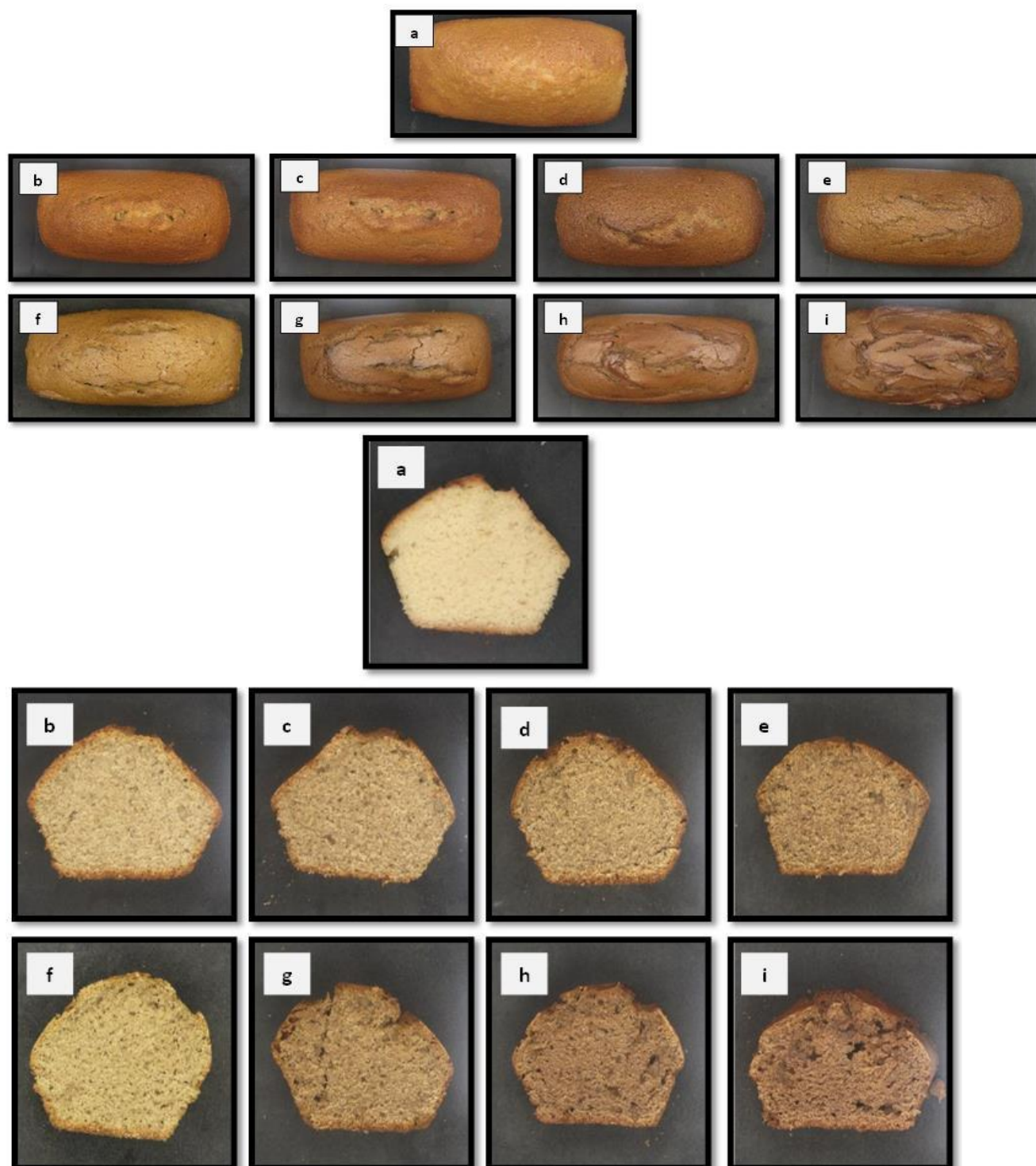
Figure 1. The crust and crumb color of cakes containing different levels (%) and particle sizes ( \mu\text{m} ) of date press cake: (a) Control; (b) 10%, 500 \mu\text{m} ; (c) 20%, 500 \mu\text{m} ; (d) 30%, 500 \mu\text{m} ; (e) 40%, 500 \mu\text{m} ; (f) 10%, 210 \mu\text{m} ; (g) 20%, 210 \mu\text{m} ; (h) 30%, 210 \mu\text{m} , and (i) 40%, 210 \mu\text{m} .