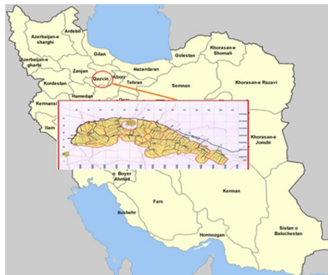
Figure 1. Study area: Qazvin Plain.

Figure 1 shows the location of study area (Qazvin Plain) in north of Iran. The needed water of Qazvin plain is provided by Taleghan dam. Water is released in no special order and is highly influenced by the urban demands of cities of Tehran and Karaj (high population concentration and extreme industrial activities) and climate-related extreme events (hydrological droughts). For the Qazvin region, urban population growth, low level of water productivity, inefficient allocation of water, and inappropriate cropping pattern are considered as major problems. In fact, the provision of adequate amount of water for urban consumption has been a challenging factor for the region. In order to solve this problem, various studies, based on technical and engineering approaches, have been conducted. However, due to the multifaceted and interdisciplinary nature of problems and issues regarding water resources (Serageldin, 1995), solution of problems in Qazvin plain requires consideration of economic, social, and