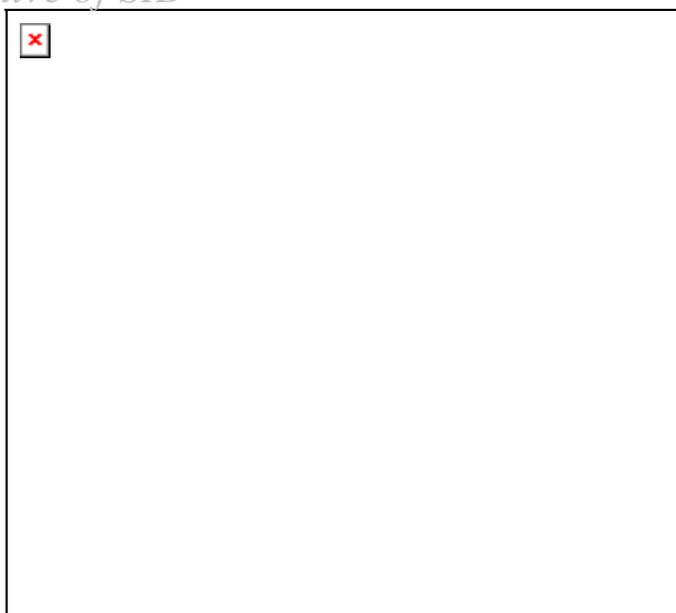
Fig. 3. Correlation of total homocysteine with diastolic

blood pressure. Each point represents the mean value \pm SD of 3 separate experiments. Y = 2.35x - 0.73 , r = 0.85 . Square = homocysteine.