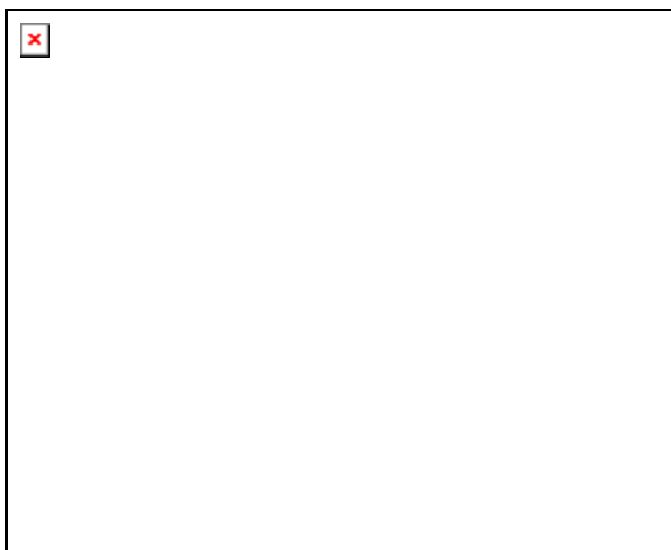
Fig. 1. Correlation of total homocysteine with serum triglycerides. Each point represents the mean value \pm SD of 3 separate experiments. Y = 2.29x - 0.74 , r = 0.86 . Square = homocysteine.

The mean serum total homocysteine level for controls was 10.55 \pm 1.48 \mu\text{mol/L} for females and 12.75 \pm 1.26 \mu\text{mol/L} for males. The mean of total homocysteine was 23.27 \pm 2.86 \mu\text{mol/L} for females case and 25.06 \pm 2.44 \mu\text{mol/L} for male cases. The mean level was significantly higher in the patients with myocardial infarction than in the control ( P < 0.05 ). Serum triglyceride values were 1.45 \pm 0.13 and 2.79 \pm 0.21 \text{mmol/l} for men in the control and myocardial infarction groups, respectively. Healthy women had triglyceride levels of 1.13 \pm 0.11 vs. 2.86 \pm 0.15 \text{mmol/l} for women in the myocardial group. Total cholesterol levels were higher in patients than in controls, 5.25 \pm 0.86 vs. 6.39 \pm 0.34 \text{mmol/l} for control men and in myocardial infarction groups, respectively. The cholesterol levels in control women and in the myocardial infarction groups, were 4.89 \pm 0.83 vs. 6.82 \pm 0.35 \text{mmol/l} , respectively. Table 1 shows the mean serum total homocysteine, triglyceride, cholesterol and diastolic blood pressure levels in patients with myocardial infarction and in the control group.