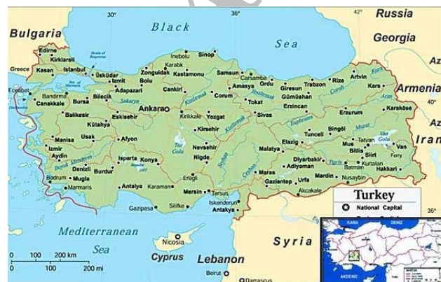
Fig. 1. Map of Isparta city in Turkey.

Biochemistry and serology. Liver biochemical tests including ALT (alanine transferase, range: 10-35 U/L) and AST (aspartate amino transferase, range: 10-40 U/L) were carried out for all patients. Serological markers for hepatitis viruses were tested with commercially available kits (AxSYM; Abbott Laboratories, North Chicago, IL, USA) for HBsAg, Hepatitis B early antigen (HBeAg), anti-HBc (IgM/IgM + IgG).