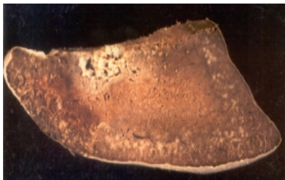
Fig 1: Macroscopic appearance of the splenic abscess in cut section.