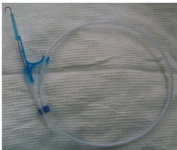
Figure 1: Guide wire «j» tip used for changing the tracheal tube.

The most common cause of reintubation during anesthesia in the operating room is upper airway obstruction and hypoventilation. Endotracheal tube cuff laceration during anesthesia is often associated with respiratory complications, reduction of arterial haemoglobin oxygen saturation, and inappropriate ventilation of the lungs. Therefore, the exchange of endotracheal tube and proper replacement with an adequate tube plays an important role. Care must be taken to reduce neck manipulation, minimize use of laryngoscopy, and cause less sympathetic stimulation. Guide wire "j" tip catheter, which is a central venous catheter, is suggested for the exchange of a tracheal tube during anesthesia without using fiberoptic bronchoscope or laryngoscopy (figure 1).