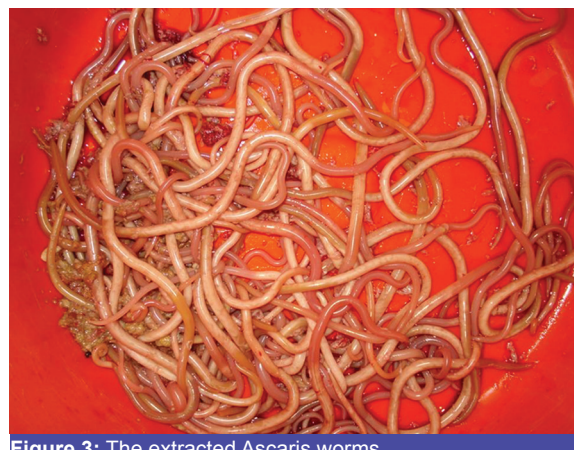
Figure 3: The extracted Ascaris worms.

was done. Postoperatively, the patient was started on the anti-helminthic drug mebendazole and had an uneventful recovery. Follow-up stool examination revealed no Ascaris eggs or worms. The ileostomy was closed at a later date.