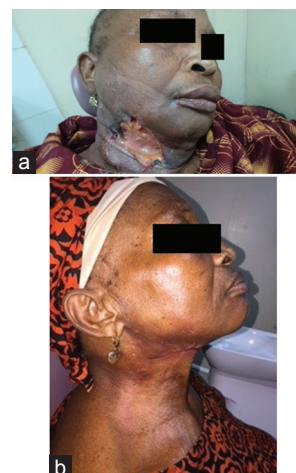
Figure 1: a) Necrotizing fasciitis, involving the right submandibular and cervical regions secondary to an odontogenic infection. b) Healing by secondary intention after serial debridement.

Clinical examination revealed a conscious and alert man in mild respiratory distress (27 cycles/min) with a pulse rate of 86 beats/min and blood pressure of 110/70 mm Hg. He was acyanosed, anicteric, afebrile (36.8 °C), and not dehydrated. Extraoral examination showed bilateral submandibular swelling with associated anterior neck swelling, which was diffuse, firm to touch, and tender. Additionally, the overlying skin appeared hyperemic. Intraoral examination demonstrated a mild trismus (about