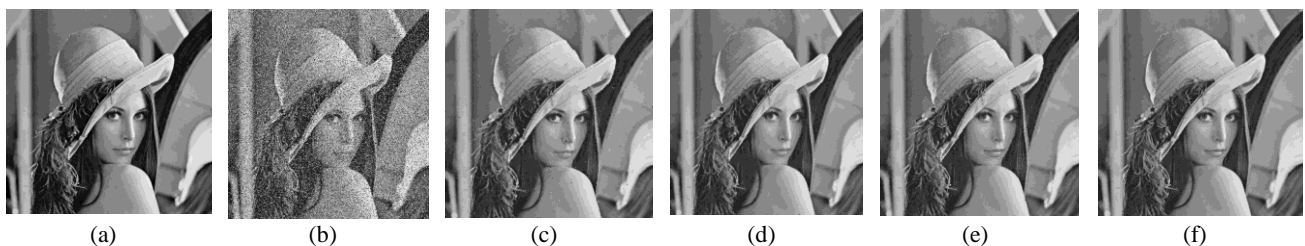
Figure 2. Lena images obtained by different median filtering methods: (a) original image, (b) noisy image added by salt and pepper noise with density 0.2, (c) SMF, (d) EMF, (e) AMF, and (f) the proposed method