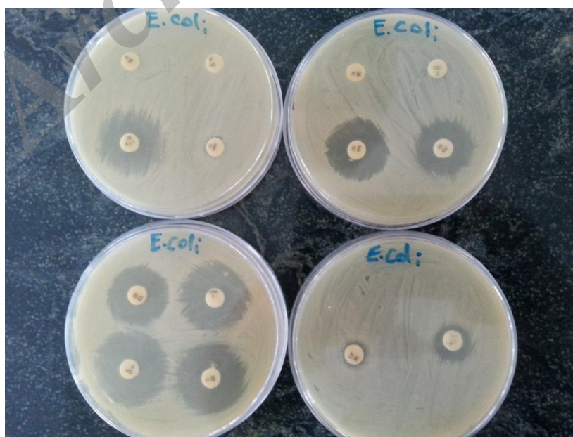
Figure 2. Antibiotic-resistance analysis of the Mueller-Hinton Agar for E. coli O157:H7.