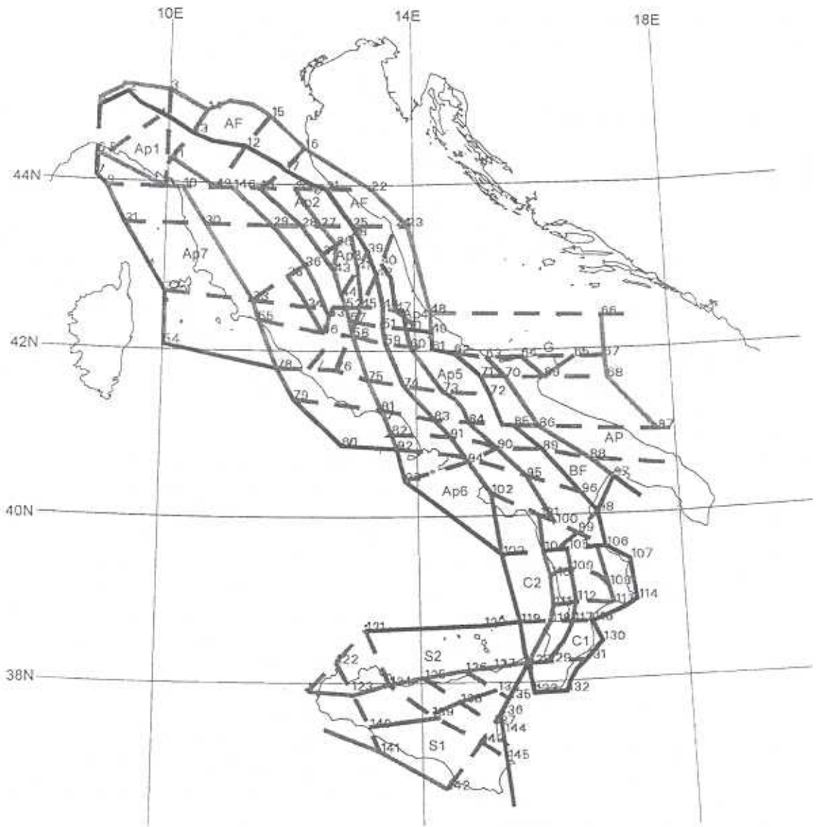
Figure 1. Morphostructural map of the study area. Violet lines are the lineaments of the first rank, blue lines are the lineaments of the second rank, green lines are the lineaments of the third rank, continuous lines are the longitudinal lineaments, discontinuous ones are the transverse lineaments. Nodes are numbered from 1 to 146. Ap, Apennines; AF, Adriatic foredeep; AP, Apulian platform; BF, Bradanic foredeep; C, Calabria; G, Gargano Promontory; S, Sicily.

The lineament 1-7, see Figure (1), corresponding to the Sestri-Voltaggio fault zone [27], is the boundary between the Apennines and the western Alps. In the north and in the east, the lineament 1-98, that separates the Apennines from the Adriatic foreland, it has been traced along the footline of the Apennines, therefore its position and configuration are slightly different from the fault line marking the Apennine-Maghrebides Main Thrust Front [28]. In the south, the lineament 103-106 is the boundary between the Apennines and Calabria: it corresponds to the Sangineto line [29] or to the Palinuro fault according to Mantovani et al [30]. In the west, the junction of the Apenninic structures with the Corsica-Sardinia block and