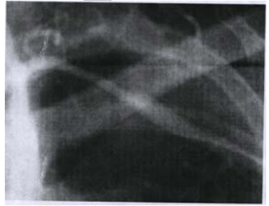
Fig.2: Long segmental stenosis in midportion of left subclavian arterry

In the renal arteries injection, 50% stenosis at origin of both arteries were associated with mild post stenotic dilatation (Fig. 3). Peripheral and coronary arteries were normal.