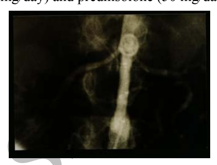
Fig. 3: Stenosis at origin of both renal arteries

The patient was diagnosed as having Takayasu's arteritis, and treatment were immediately started with aspirin (100 mg/day), diltiazem (180 mg/day), triamteren-H (50 mg/day), ferrous sulfate (50 mg/day) and prednisolone (50 mg/day).