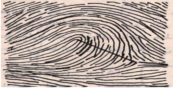
Fig.1: A typical figure showing how to count the ridges of the loop shaped fingerprints (13).